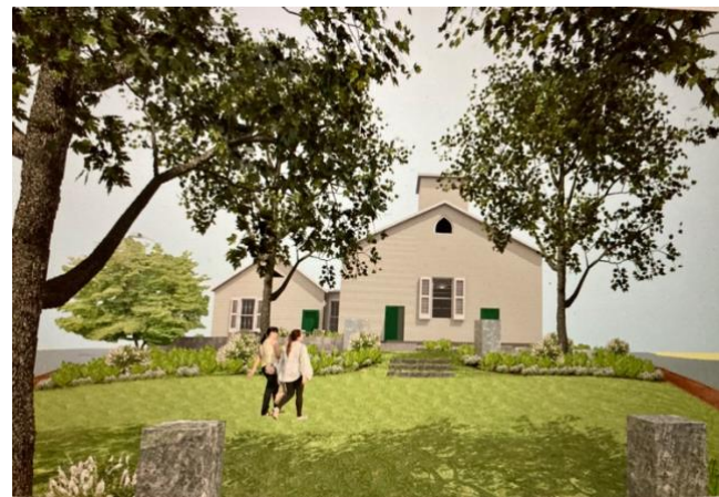
(A vision of the future, thanks to Pellettieri Associates)

You can help make all this possible with a generous contribution to MainStreet Warner, Inc. Thank you!